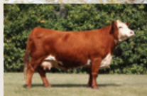
Dam of Lot 100

We're always excited when we can inject some really cool new breeding into the horned gene pool. That's what 100M is, out of our Action daughter, Marigold, crossed with the Notice Me female in Arlo, we like what he has to offer in terms of leaving highly predictable replacements. Long bodied, good muscled, with a thick top while retaining a smooth shoulder. When you can get a pigmented bull like this that's something different, it's worth taking a look at.