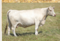
Dam of Lot 433

433M is out of a proven cow that knows how to add some pounds to them. This guy posted a 3.40 ADG in some harsh terrain, going on to grow out into a stout muscled. Big bodied bull with a solid skull. His dam is a great uddered Firestruck female who always weans off a sizeable one.