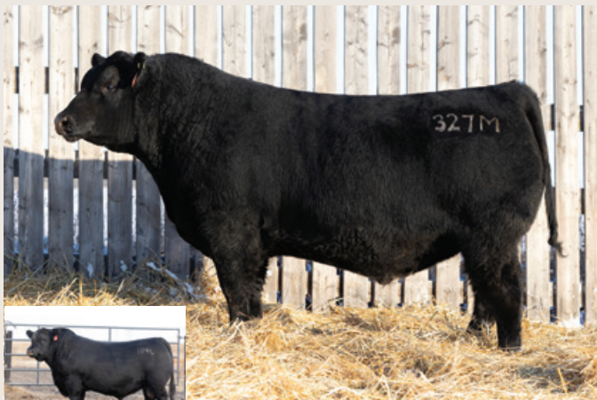
Maternal Brother of Lot 327

327M is a moderate framed, low BW option ¾ brother to our lead off bull from last year. From the same dam, he was sent into the back country and posted solid gains with an impressive YW. Bold ribbed, solid muscled, great fronted, with plenty of thickness. Top 5% RADG, Udder & Claw, 25% Angle, YW, Marbling, & Teat.