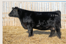
Maternal Sister of Lot 212