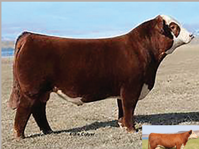
Dam of C Arlo 2135 ET

Known here affectionately as "Leachman" this bull has been a great addition to our bull battery. He is a bull full of muscle and exhibits a "look at me" profile no matter where you see him. Despite his overall attractiveness, perhaps his best attribute is an exceptional foot. Big and deep heeled and perfect in its shape on all 4 corners. The offspring are marked solid and made solid with daughters showcasing a tight udder with moderate teat size. We like problem free and think you will too!