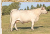
Dam of Lot 435

This guys a low birthweight, fast growing unit. Thick bodied, stout made, heavy muscled while still retaining the overall softness throughout his hide, and boldness in his rib we love to see. A fantastic young producer for a mom, with an udder that could be painted any colour and called great, and a great foot underneath him. Top 10% REA, WW, & MCE, 15% CE & SC, 20% BW, YW, & TSI.