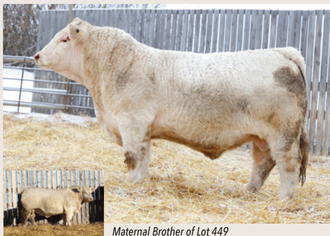
Maternal Brother of Lot 449

449M is a easy moving, low birthweight, very sound bull. Loose hided, expressive over the top of his rib, through his hindquarter and down into his lower third. This guy is a well balanced breeding piece that can get the job done.