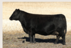
Dam of Lot 269