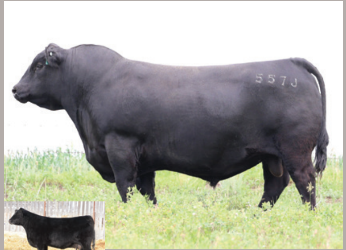
Dam of Landslide 560J and Landmark 557J