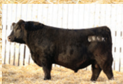
Maternal Brother of Lot 333