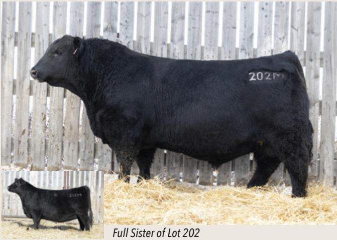
Full Sister of Lot 202