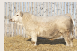
Maternal Granddam of Lot 483 Maternal Brother of Lot 483

483M is a moderate statured, high performing bull out of a nice Tank daughter who has hit her stride. He's bold everywhere, in his hip, his presence, his muscle pattern, and throughout his rib shape. This guys a hairy bull we think will make quite the breeding piece.