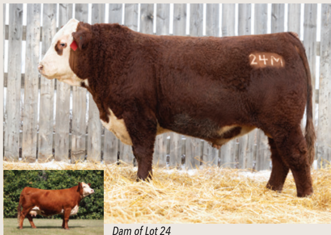
Dam of Lot 24

Another Arlo x 606H flushmate, 22M is deep flanked, wide made, exceptional in his muscle layout, and clean through his sheath. If you like cattle with a bit of softness while retaining some presence and look, this prospect deserves to be on your list.