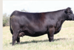
Dam of Lot 323