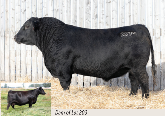
Dam of Lot 203

202M is a Glacier out of the $200,000 valuation Argentinian outcross Blair's Sarita female. The full sister just sold half to Jesse Winchester for $37,500, which we're extremely excited about. Combining the great Donna line with the highly predictable Sarita, has led to this big middled, thick topped, and long bodied bull with a great skull and front end.