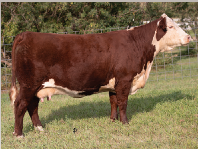
Dam of Glenlees 39G Devout 38K

The $195,000 lead off from Colyer Herefords, purchased by Hoffman Ranch and Buck Cattle Co., Arlo is big boned, exemplary footed, and ideal in his pigmentation. His dam is the well-established C Notice Me and is profound in her phenotype and production record. We wanted a bull we could utilize that could add some look, pigmentation, and strong maternal traits while maintaining structure. Arlo is just that, this is his first offering, and we think they're pretty neat, with the females being even better. Nice numbered, short marked, but solid on the performance data and structure, these offspring have been consistently marked up with pigment.