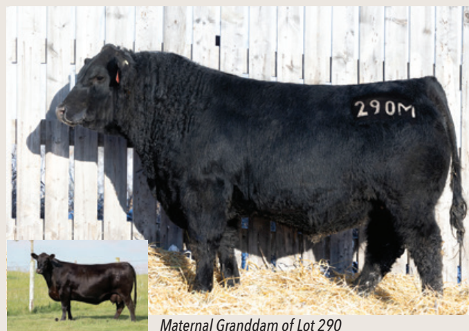
Maternal Granddam of Lot 290

Lower BW powerhouse here, a true anomaly. Rarely is it that a 78 lbs calf weans off at 759 with an ADG of 3.32 lbs/day. Long spined, out of a top producer, it's easy to see how this one would push the scale down. Raw muscle, good structure, and herd bull look. Top 6% Claw and Angle.