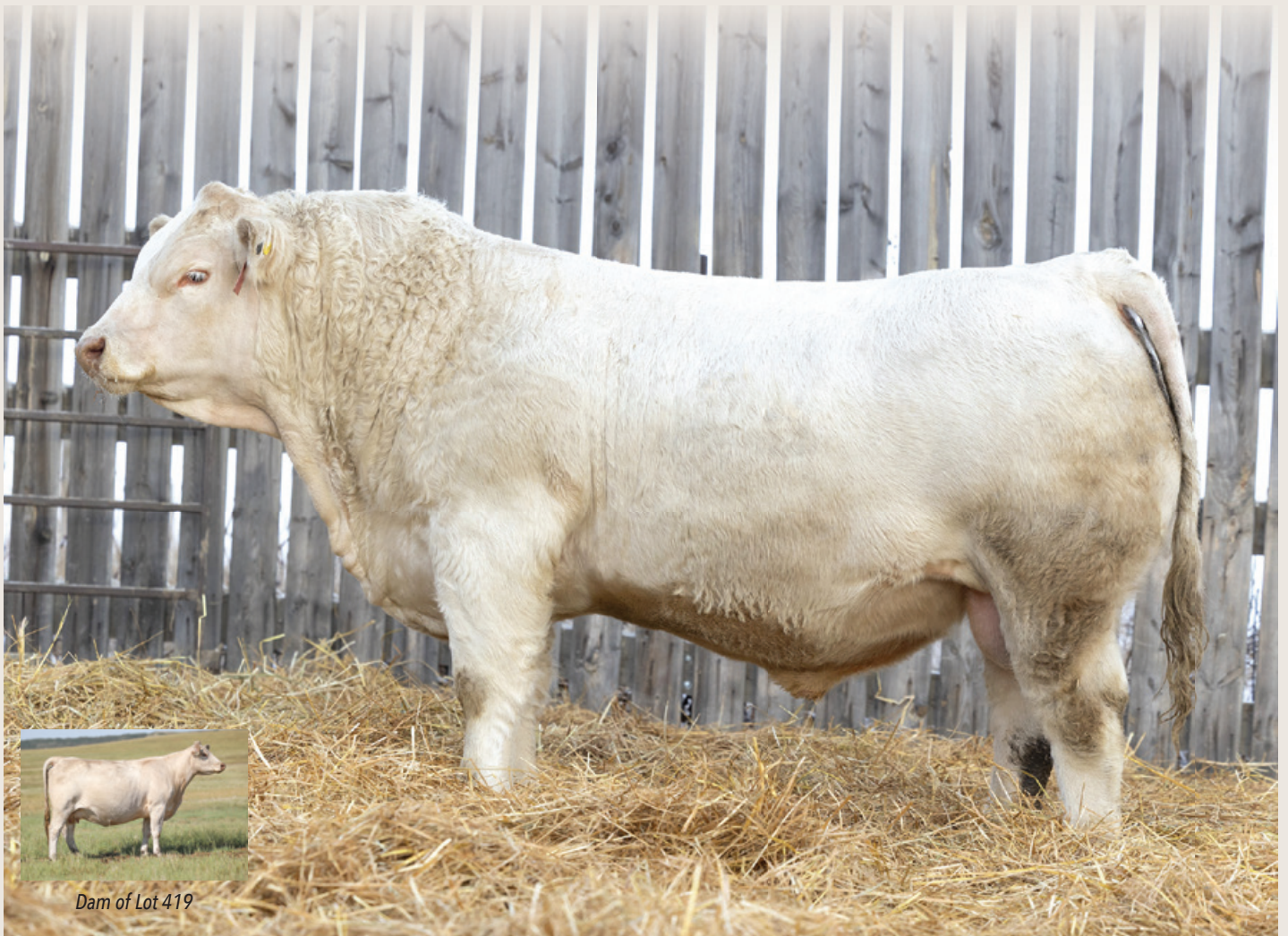
Dam of Lot 419