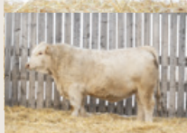
Dam of Lot 412

This JJ son is out of a big bodied, small teated female that can raise them. Moderate BW with a 3 lb ADG on just mom in the river hills is a big ask but she accomplished it. Big topped, longer bodied, and big boned. 412M is an attractively put together package. Top 5% WW, 10% MWW and SC.