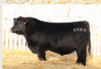
Maternal Brother of Lot 255

255M stems from a long-standing, big bodied, strong uddered Shade daughter who has withstood the test of time in some of the harshest pastures we have. Regardless of the environment and mating, this guy is her type to make. Long spined, a touch more frame, but big barreled, superbly balanced with some meat and potatoes to him.