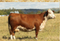
Dam of Lot 47