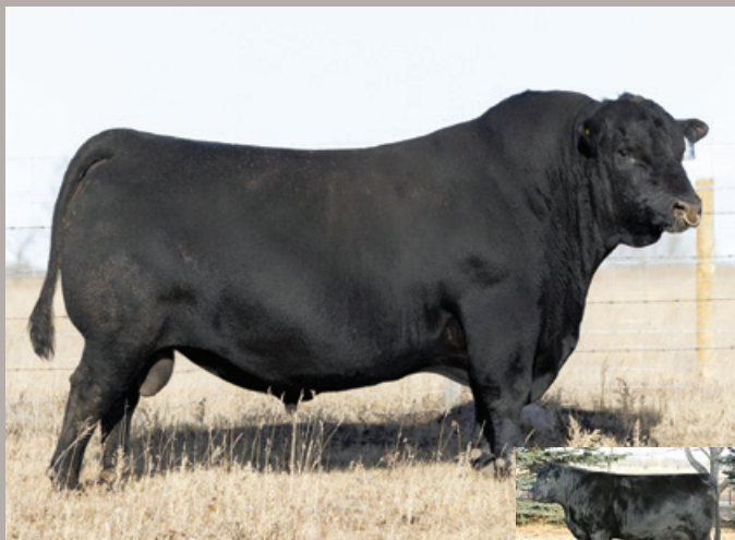
Dam of Collins El Chapo 2101