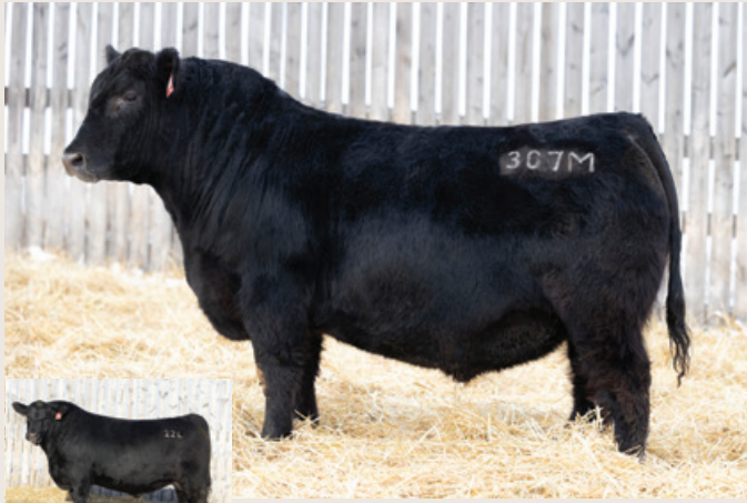
Maternal Brother of Lot 307

A great uddered first calving 601E females first calf, this guy is heifer safe and still has some growth to offer. Average framed, but deep flanked, wide pinned and level topped, his greatest asset is his foot quality and smooth make. Top 15% CE, 25% Claw and Angle.