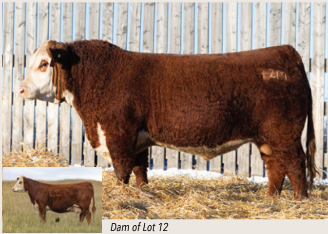
Dam of Lot 12