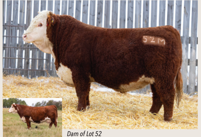
Dam of Lot 52

This horned bull stems from a strong cow making her way to the donor pen this coming year. She had a great bull in the sale last year and a superb heifer in this year's replacement pen that brought $12,000 to McLennan Creek Herefords for pen. Easy calving, a great foot and loose hided with loads of rib. If you like your horned bulls with some extra width and great maternal traits, add this guy to your list.