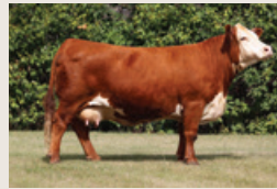
Dam of Lot 28

GE EPD | Horned | Parent Verified | Pigment: 30%R : 100%L CALVING EASE: ★