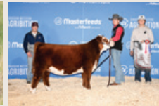
Full Sister of Lot 22