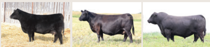
Dam of Lot 302