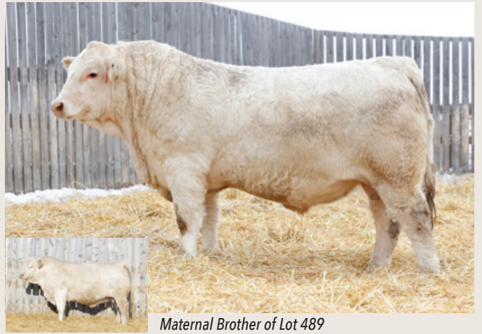
Maternal Brother of Lot 489

This young PVF cow raised a soggy middled bull to put in the sale, he's big boned, elevated fronted. Wide through his pins, and down to his base, 489M has a solid hair coat and a lot to offer.