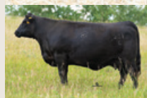
Dam of Lot 339