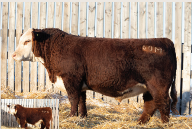
Maternal Brother of Lot 60

59M combines a few greats, a Nellie cow out of the 2018 World Champion Rocky, combine that with the growth and muscle that Forefront brings to the table and you get this. Thick made with our kind of muscle shape, this guy puts maternal, muscle, and structural quality along with some solid carcass and performance numbers in one unique package.