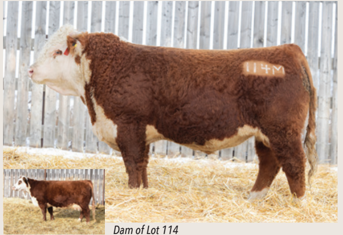
Dam of Lot 114

The latest born bull in the offering, 114M is a low birthweight breeding piece that injects the great Nellie cow line into the horned genetic pool. Moderate framed, well muscled, with a great foot and attractive look.