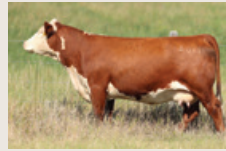
Dam of Lot 22