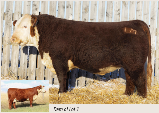
Dam of Lot 1