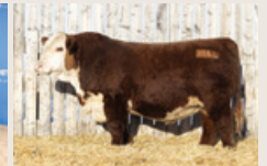
Maternal Brother of Lot 22

Another Arlo x 606H flushmate, 22M is deep flanked, wide made, exceptional in his muscle layout, and clean through his sheath. If you like cattle with a bit of softness while retaining some presence and look, this prospect deserves to be on your list.