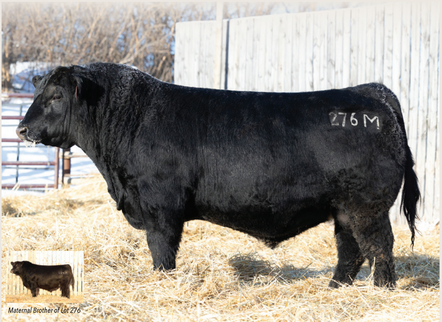
Maternal Brother of Lot 276