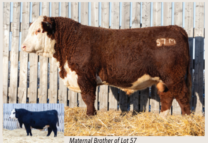
Maternal Brother of Lot 57

57M is a bull for those looking for some extra jam in a slightly more moderate package, out of a highly productive female we obtained as an embryo from Uruguay, he packs punch. Soft made, extremely sound and thick made throughout his skeleton, there's some unique pieces here to add value to this prospective herd sire who has nice pigmentation.