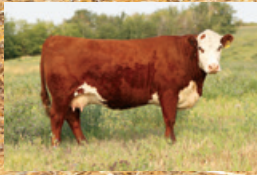
Dam of Lot 46