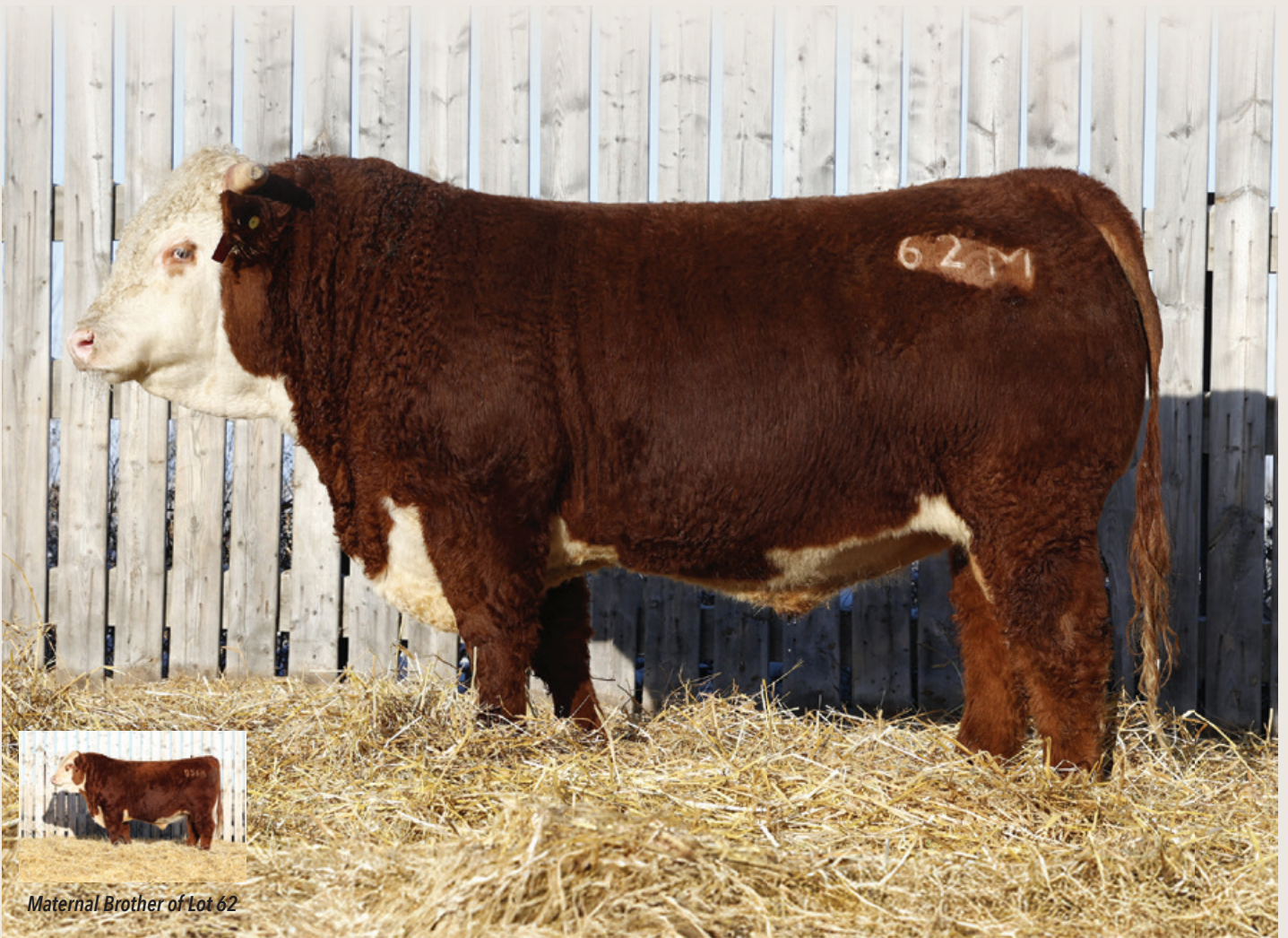
Maternal Brother of Lot 62