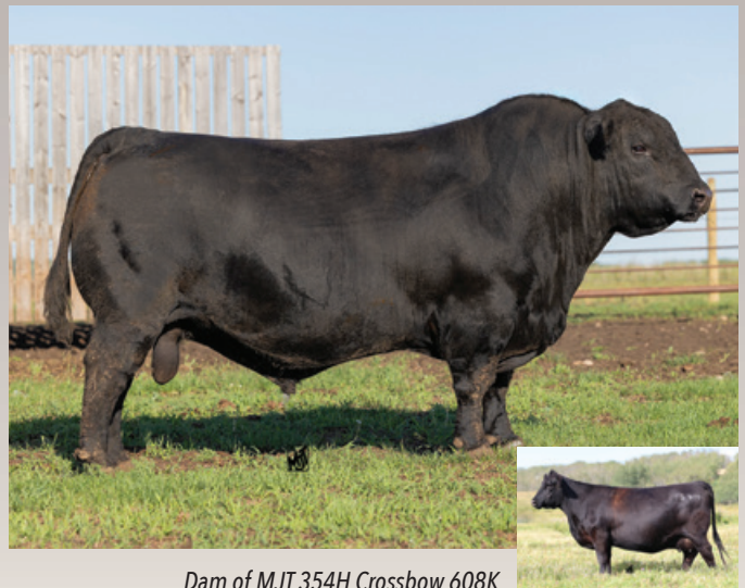
Dam of MJT 354H Crossbow 608K

When we look at the hall marks of a great bull, it starts with the females behind him. With Envious Blackbird in the top pedigree, Socialite and Bar-E-L Erica 74A in the bottom, this bull is maternally stacked. His dam Socialite 354H is often a favourite on farm tours and prepotent for producing our type of cattle. We have used him on many heifers with no problems, and the calves stay moderate while putting on muscle and pressing down on the scale at each evaluation point in their life. The sisters have been hits with the first ever on offer to sell for $24,000 to Golden Oak Livestock, and the daughters, top prospects. We think these sons will leave top end progeny in both gender pools.