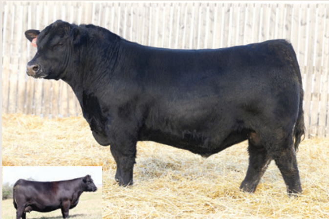
Dam of Lot 316

Backed by a top Impressive daughter, known for their foot quality and her superior udder quality, 313M is a heifer safe option that is going to leave replacements you'll be wanting to keep. Stout, thick, bold ribbed, and deep flanked, he's a Top 10% RADG heifer bull ranking top 20% in CE and BW.