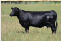
Dam of Lot 254

A moderate birth weight son of a first calving Classic daughter with a strong udder composition, 254M is a neat individual. Nice frame size, big topped, deep and bold middled, with a high-quality foot and leg, he's an overall complete bull. Nice BW with some serious gains and a great dam. Top 1% teat and udder, top 25% BW, WW, YW, RADG.