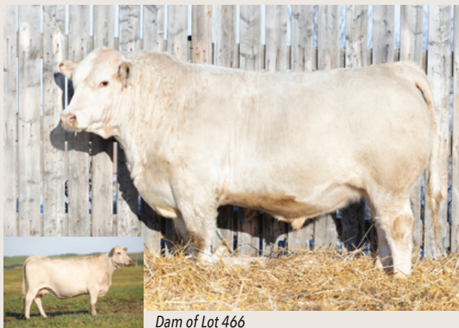
Dam of Lot 466

This moderate framed, low birthweight bull in our offering comes from a top uddered, high-capacity Ledger daughter that has proven her merit. Extremely stout, expressive in his muscle shape and bold in his center mass, 466M is a compact package to add lbs to the calf crop.