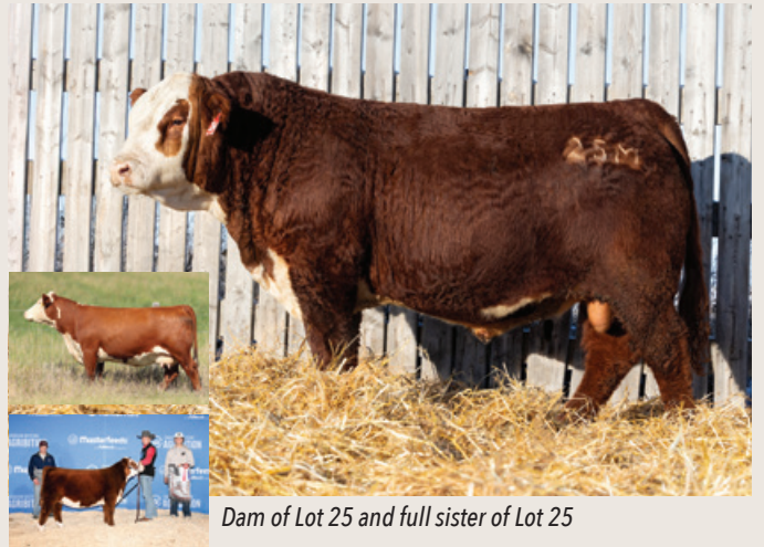
Dam of Lot 25 and full sister of Lot 25

This is a bull we decided to utilize in covering a small group of cows this year post-AI. Another Arlo x 606H, there isn't a lot we don't enjoy about this bull. Extremely complete, not only is this bull good footed with a ton of heel, he's also nice fronted, bold middled, and wide throughout. Add to that a solid muscle pattern and that 606H dam and you have quite the package.