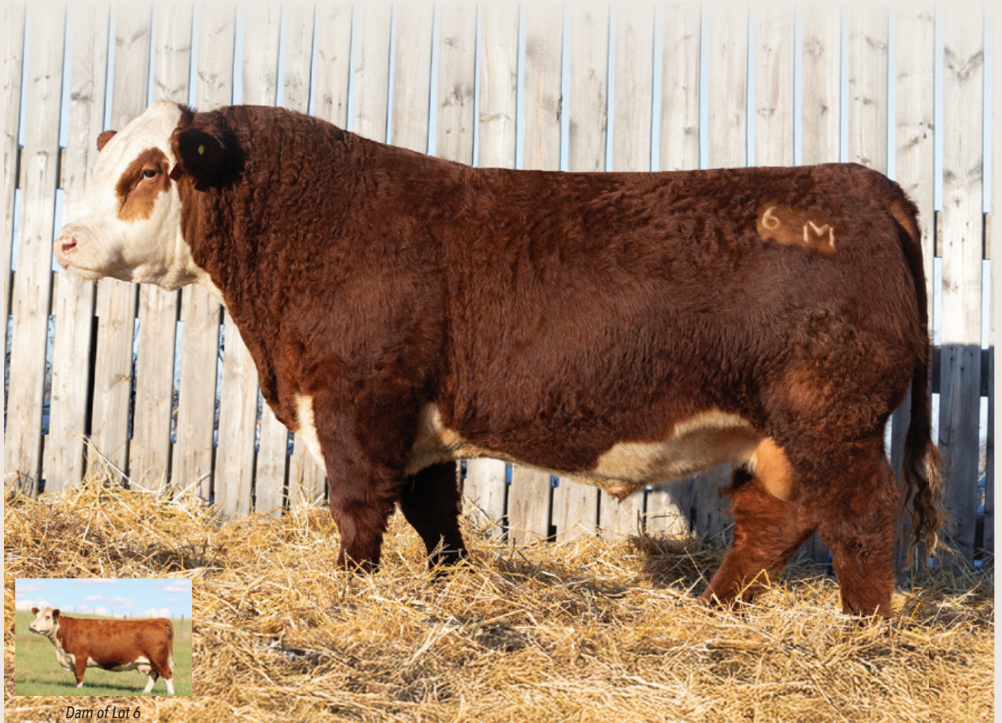
Dam of Lot 6

A rare package here. One of the first Arlo sons to be marketed in Canada, backed by the Nellie cow family, this big goggled, short-marked individual is an extremely maternal specimen with top tier foot structure, muscle shape, and overall performance. It is rare that the genomics on a bull line up with their phenotype, however between his carcass merit, performance, and maternal indicators, and actual performance, it is few and far between that a bull this complete crosses a sale ring.