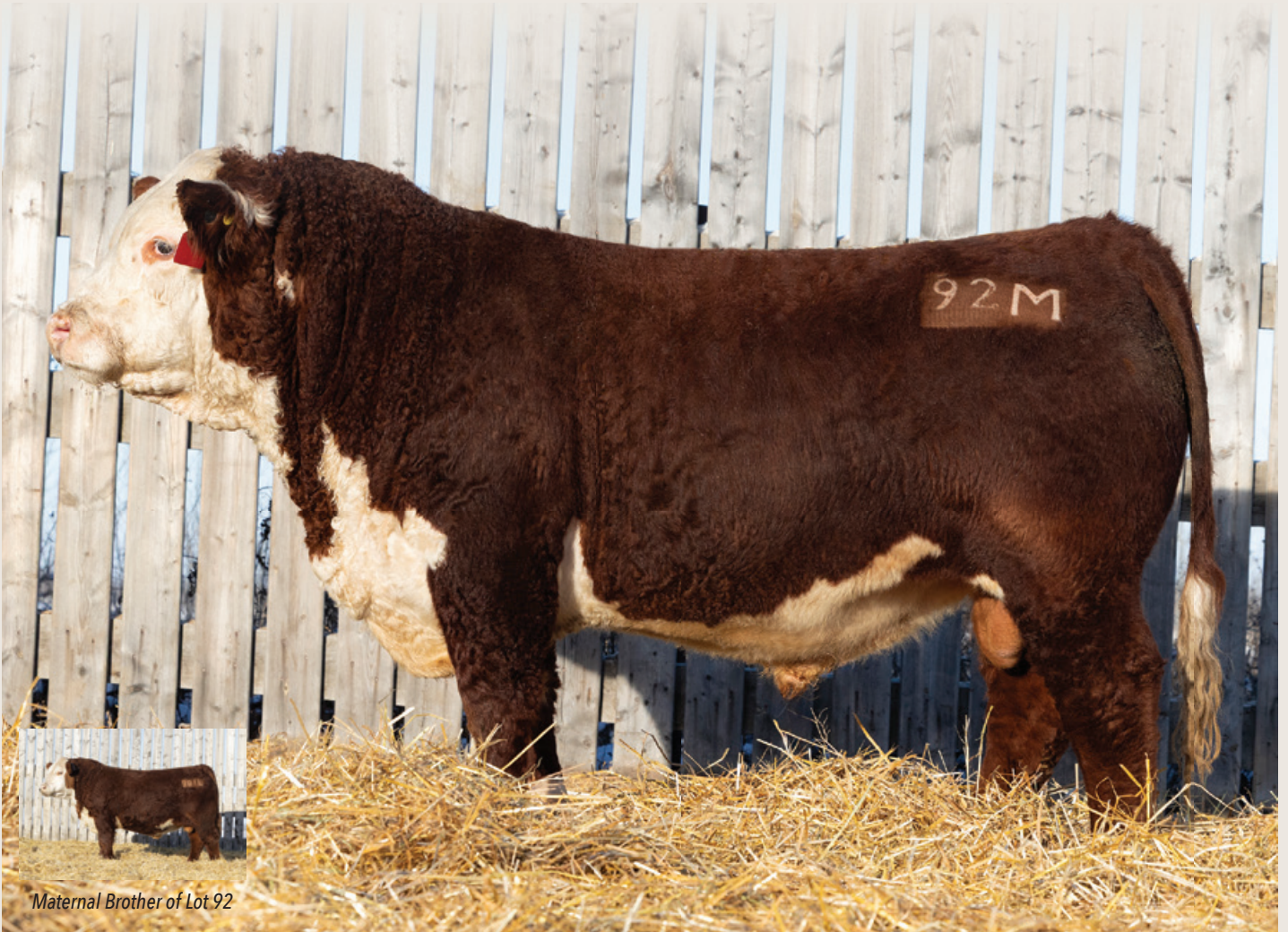
Maternal Brother of Lot 92

92M combines low birthweight with performance and growth. Smooth shouldered but big ribbed, thick topped, and deep sided. When it comes to muscle shape and herd bull look this guy doesn't slouch either. His dams a maternal sister to our Marigold donor out of Rocky, the 2018 World Champion. His scrotal, fertility, and maternal productivity EPDs are all top 2-10% with marbling and post weaning gain in the top 25%.