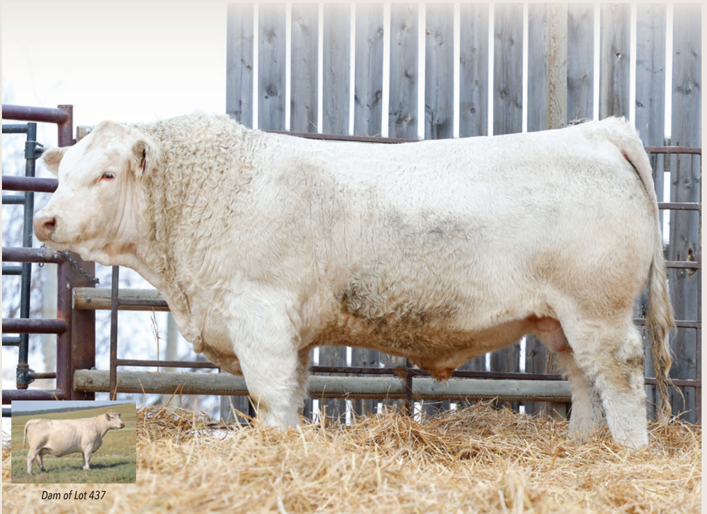
Dam of Lot 437