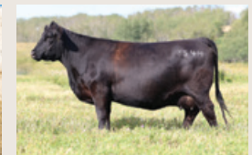
Maternal Sister of Lot 212

The dam to 212M is the great Merit Socialite 3048, a female that has been, and continues to be, a cornerstone of our Angus program. The granddam to our 608K herd sire who is heavily featured, she stamps her offspring with quality. Heifer certified, great footed, smooth shouldered, big hiped, with such a good presence and muscle shape to him. This bull is phenotypically great, and ranks Top 3% in foot angle, 7% in YW, WW, CW 15% REA, 10% Marbling.