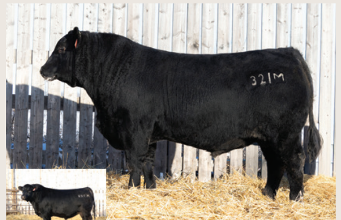
Maternal Brother of Lot 321

321M is a bigger framed performance package, posting a 3.1 ADG this guy has lbs to spare. Long spined, expressive in his muscle, and wide over the top of his skeleton. He's backed by a powerhouse dam who passed her foot quality onto this guy.