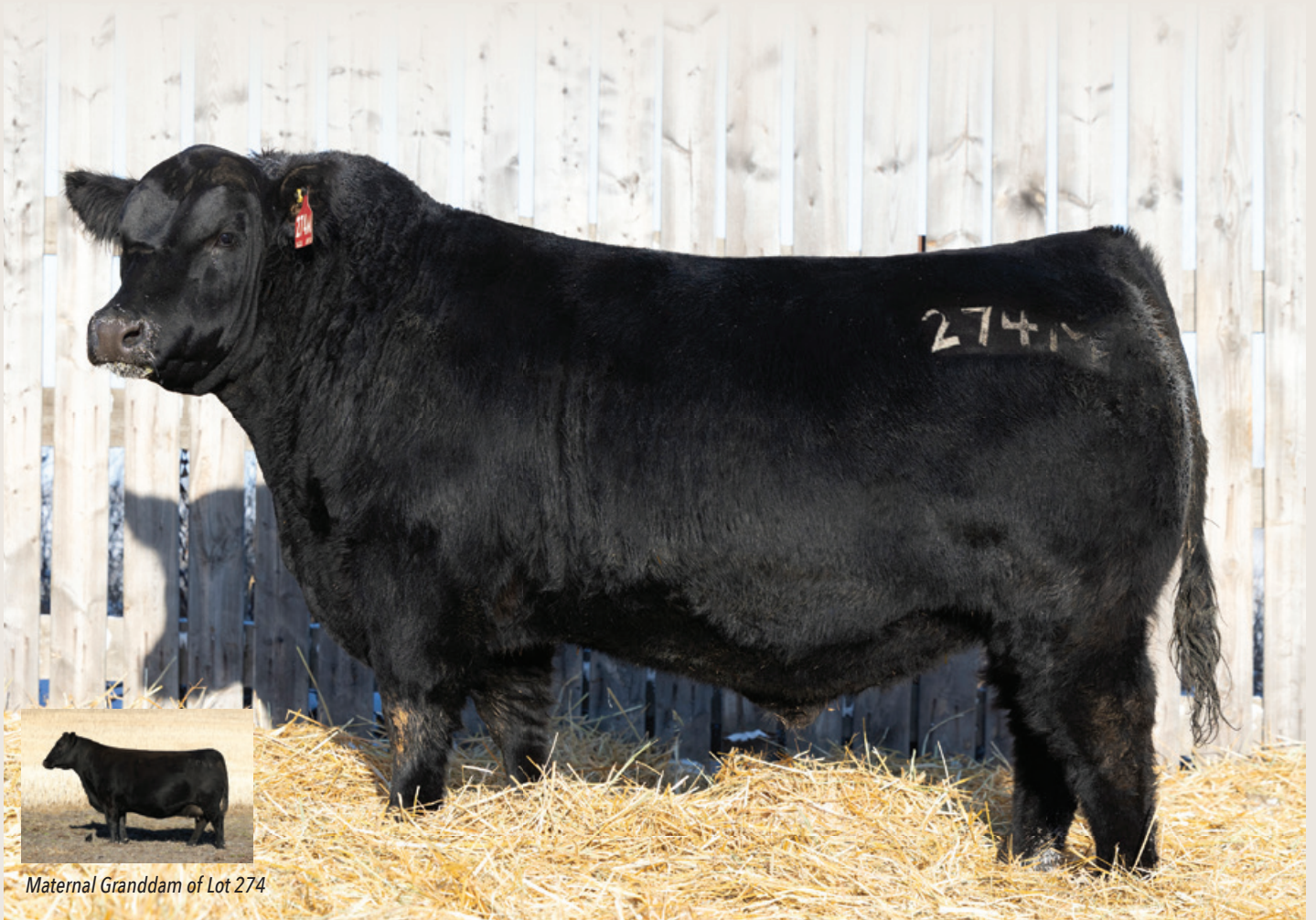
Maternal Granddam of Lot 274