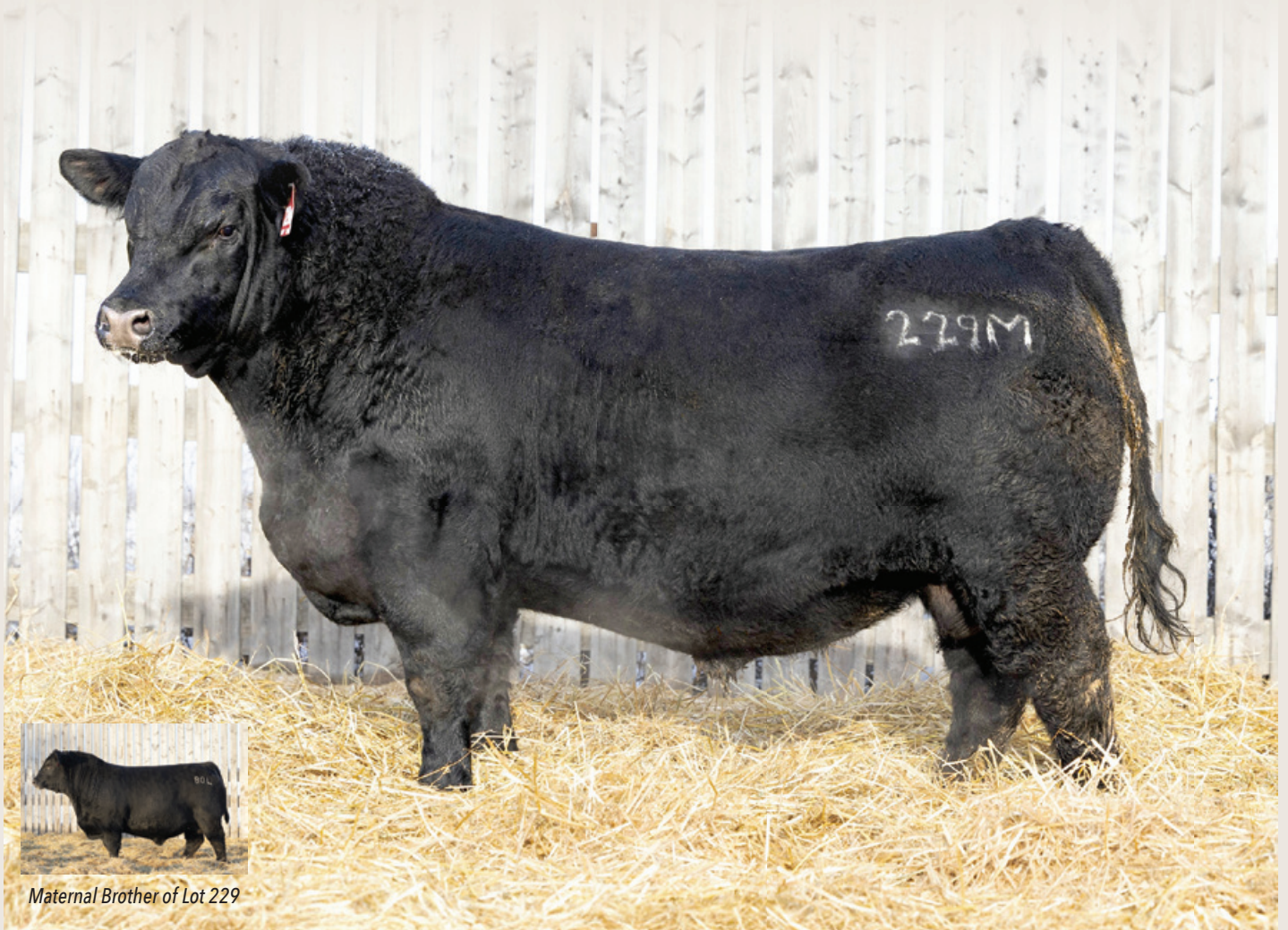
Maternal Brother of Lot 229