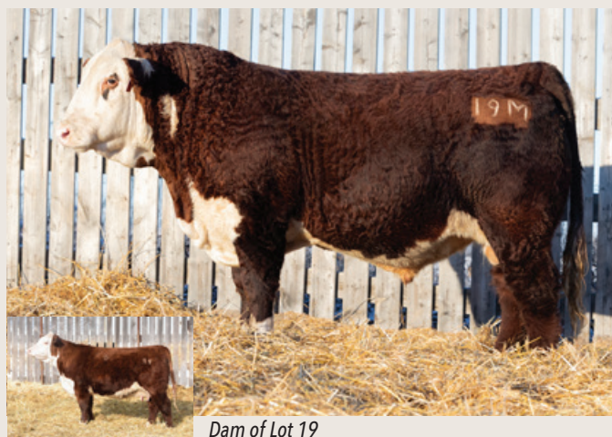
Dam of Lot 19

H BK CCC SR GAME CHANGER ET HAROLDSON'S AD JESSICA 48Y 13B TCF JVJ 11X THE GOODS 305A COPPERTONE 1W 164X OMEGA 8Z