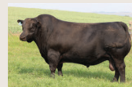
Maternal Brother of Lot 269

269M has all the pieces. Moderate birthweight, a 3.19 ADG, and loads of muscle, hip and middle. He puts calving ease and performance in one package with an ideal herd bull look, in spite of loosing his tail this summer. Backed by our 808F donor cow, the dam to our late 92G herd sire, the predictability of this bull in terms of what he has to offer in both gender pools quality is second to none.