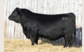
Maternal Brother of Lot 323

323M has the look, genetic backing, and quality to go the mile. This big ribbed, stout hipped, and well muscled, calving ease bull is backed by one of the greats. 595F is one of the great offspring from the Duff Napoleon x 74A crossing that's taken the continent by storm. When they look like this guy and read on paper as well as he does, it's easy to see why. Top 2% Angle & Udder, 10% Claw, CE & Scrotal, 25% BW, WW, YW, RADG.