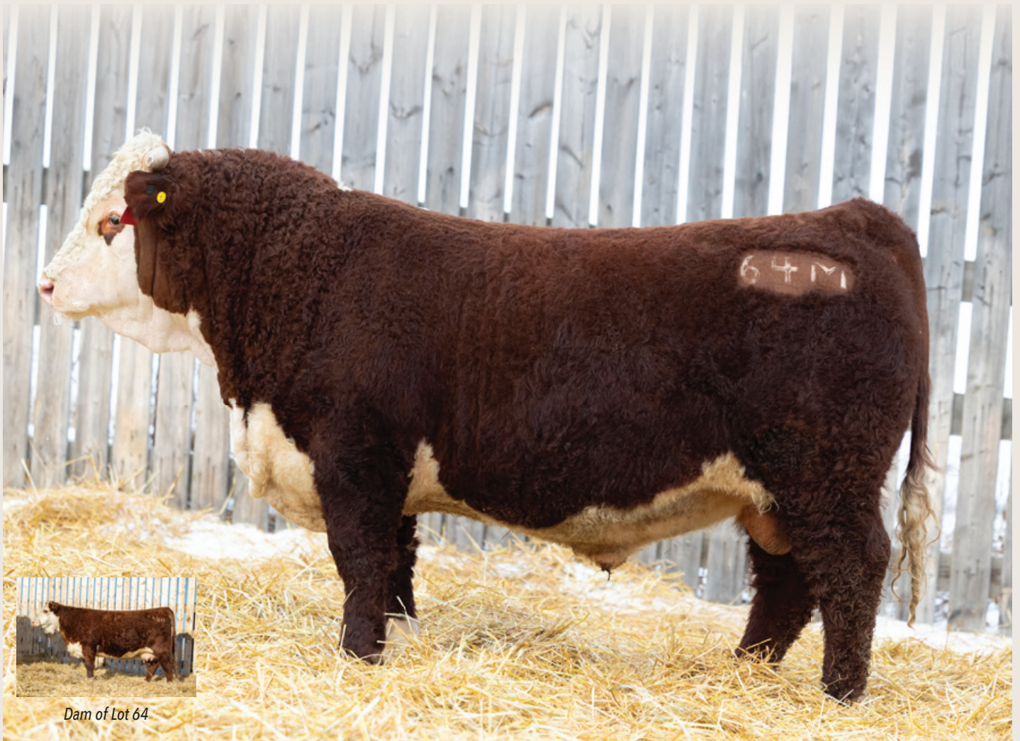
Dam of Lot 64