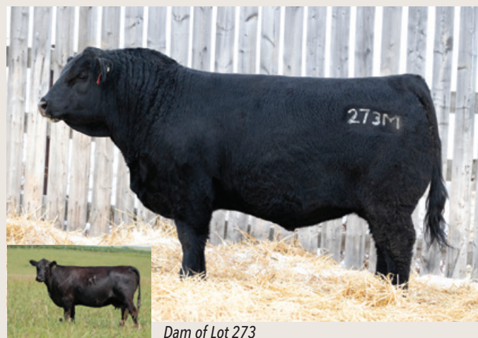
Dam of Lot 273

269M has all the pieces. Moderate birthweight, a 3.19 ADG, and loads of muscle, hip and middle. He puts calving ease and performance in one package with an ideal herd bull look, in spite of loosing his tail this summer. Backed by our 808F donor cow, the dam to our late 92G herd sire, the predictability of this bull in terms of what he has to offer in both gender pools quality is second to none.