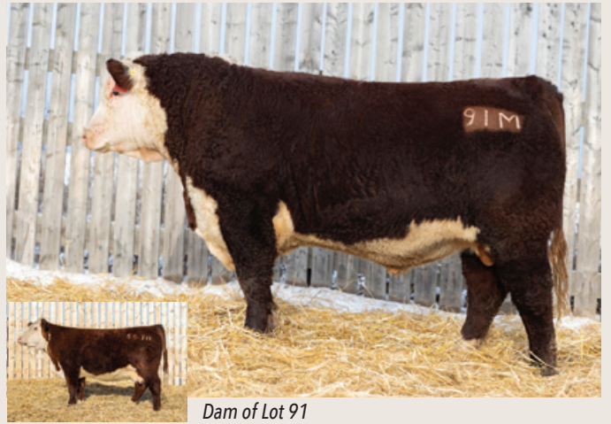
Dam of Lot 91

Dark red, moderate in both birthweight and frame, and short marked, 91M is one for those that like rib, muscle and top in a compact package. His dam is a great uddered, Churchill Rock daughter, and a maternal sister to the 2018 Champion of the World.