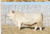
Maternal Brother of Lot 460

This stout made, loose hided bull is from a great uddered, 10-yr-old Distinct daughter. This trusted and proven cow raised a solid bull with a comfortable birthweight that didn't skimp in performance. Top 10% MARB, 25% WW.