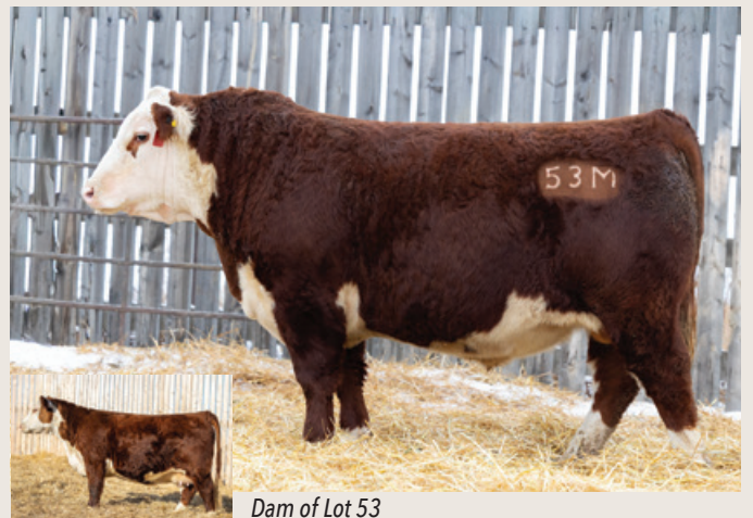
Dam of Lot 53

A moderate birthweight bull with a solid gain leading to a strong weaning weight, good pigment, and a great foot. We like bulls' stout with solid muscle. The fact that 53M does this while also maintaining an admirable amount of balance is the cherry on top. For those that pay attention to pedigrees it's also important to note that his dam is a solid Royal daughter, renowned for their udder quality.