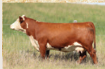
Dam of Lot 108

Middle of the road birthweight but weaning off at the higher end of our offering, 108M is the natural calf off our 606H donor cow. We love his dark red colour, skull shape, and smooth shoulder while retaining some muscle shape. Combining the great Cameo Girl and Nellie cow families is a highly predictable maternal dream.