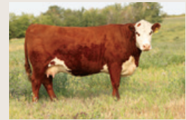
Maternal Sister of Lot 28

This fellow here is our Marigold donors own natural calf. Backed by the maternally oriented Silver Creek sire, this well-balanced individual is stout made, extremely athletic, and just solid throughout.