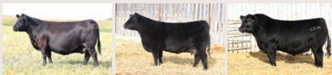
Dam of Lot 344