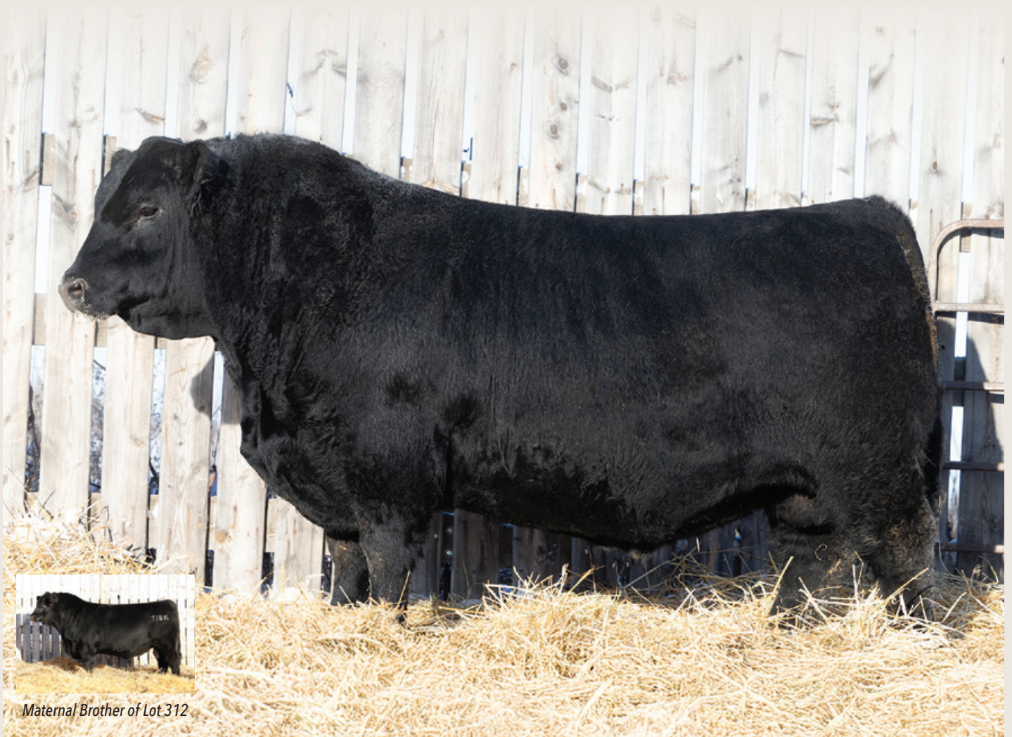
Maternal Brother of Lot 312