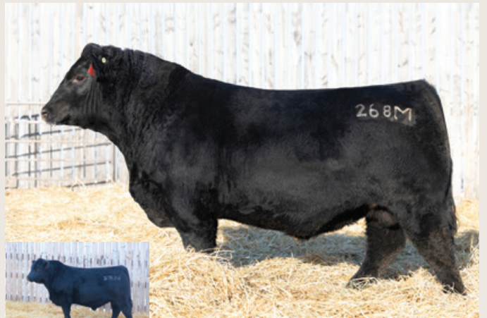
Maternal Brother of Lot 268

This bull is performance through and through. A nice frame size, plenty of bone, and a whole lot of length. Backed by a proven Shade daughter, they don't make it to her age without solid foundations and proven production record.